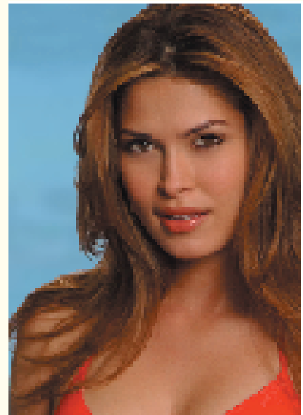
Justine Pasek - Miss Universe 2002

The National Library of Panama, located in the Omar Recreation Center, is one of the largest and most modern in the region. It keeps books by national and Iberian-American authors, collections, research and official documents, audiovisual materials, periodicals, a newspaper library, official gazettes and judicial registries. In addition, Panama City offers a great variety of book shops and specialized libraries. There are several literary groups. The most active is the Santa Maria la Antigua University (USMA) Readers Group that even publishes books by local writers.