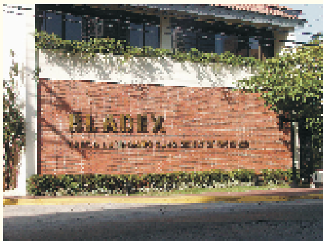
Latinamerican Exports Bank (BLADEX)

For 100 years, the US dollar has been the legal currency in Panama. With a strong economic stability, the financial system allows the free flow and transfer of capitals and its attractive fiscal system is an essential factor for the sector's development. There is a large variety of financial services at very attractive costs offered through banks, stock exchange, money exchange offices and financial companies. The interest rates in US dollars in the country are the lowest in the region. The growth of the financial center stimulated the development of national banking. Panama has 18 banks of local capital with presence in the different areas of the Panamanian economy. The National Bank, one of the two State-owned banks, serves as the compensation chamber for Panamanian financial entities. The financial Center complies with international money laundering control regulations through the Banking Superintendence and Financial Analysis Unit. The active Panama Banking Association, composed of the majority of bank entities, is the founder of the Latin American Banks Federation, (FELABAN) which celebrated its first meeting in Panama. The Latin American Exports Bank (BLADEX), the largest in Latin America to finance exports in the region, also has its head office in the Panamanian capital.